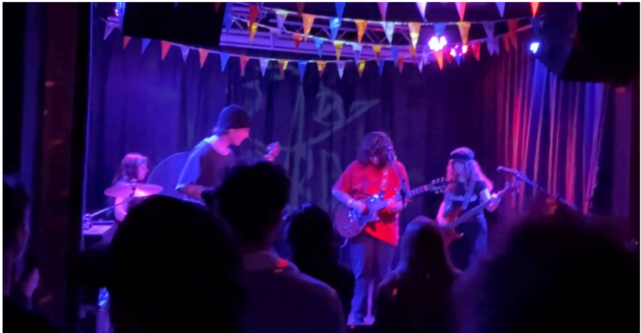
Dullhouse, The Bird, WAMcon 2025