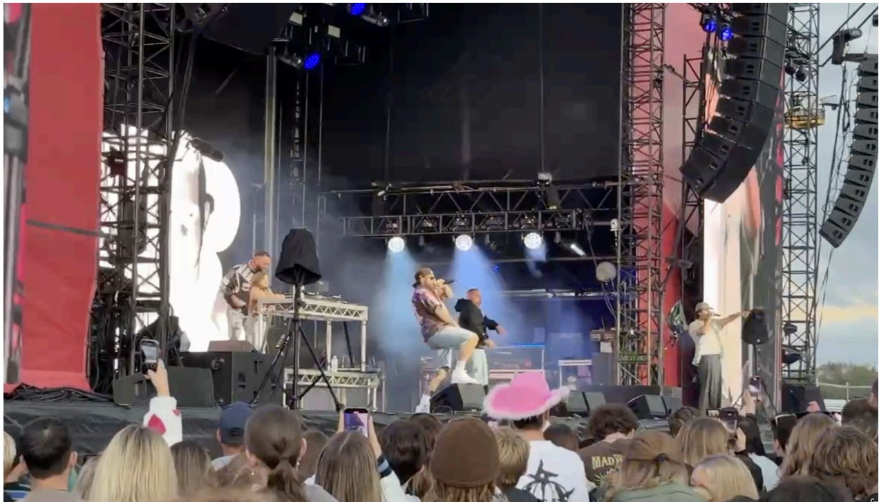
3% Triple J One Night Stand, Bussleton