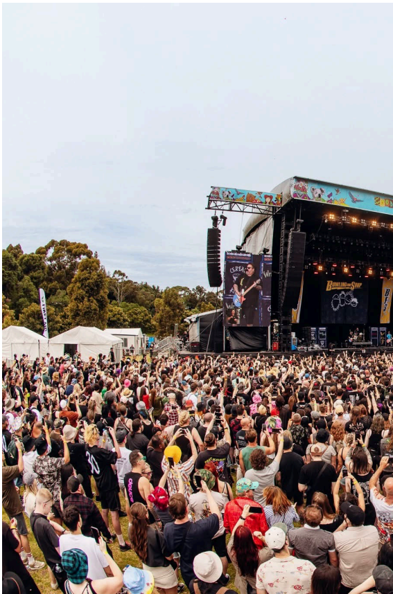
Good Things Festival

No local government has been able to extend that cover to include local live music venues outside of local council ownership, although a small number have shown high levels of interest in ways to enable this.