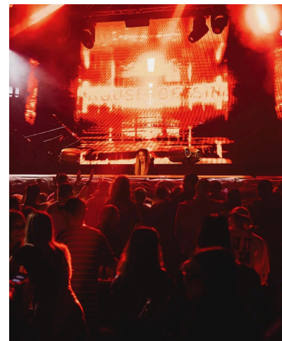
Sammythesinner / House of Sin