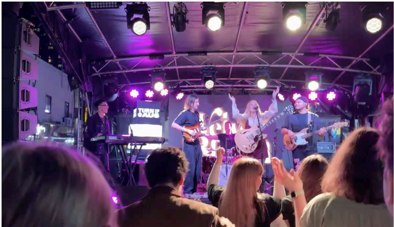
Velvet Bloom, Valley Mall, BIGSOUND

The ALMBC has also provided intensive support and business tools to our members to enable best practice in risk management. Tools such as RiskSurvey+ and FMTrack allow live music businesses to better present their business to insurance underwriters for them to evaluate risk and quote.